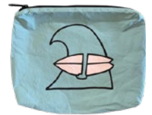
JJ Surfing Wave ALOHA Collection Small Mint Pouch