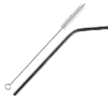
Stainless Steel Straw, Straw Cleaner