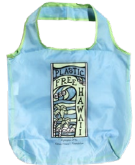
PFH Tote Bag