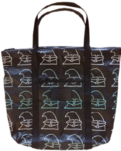
JJ Surfing Wave ALOHA Collection Zippered Black Tote Bag

100% of net proceeds from the purchase of these items directly support Kōkua Hawai'i Foundation's Plastic Free Hawai'i program, which educates and empowers schools, businesses, & community members to minimize single-use plastics.