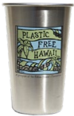
PFH Pint Cup