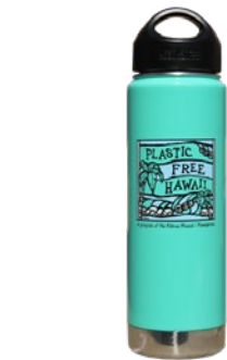
PFH Kleen Kanteen Insulated Bottle