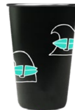
JJ Surfing Wave Pint Cup