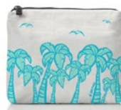
PFH ALOHA Collection Small Pouch