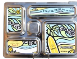
PlanetBox Lunchbox & Bag