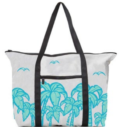
PFH ALOHA Collection Zippered Tote Bag