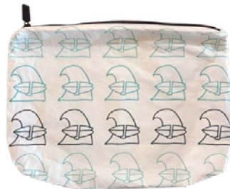
JJ Surfing Wave ALOHA Collection Medium White Pouch