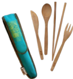
PFH Bamboo Utensil Set