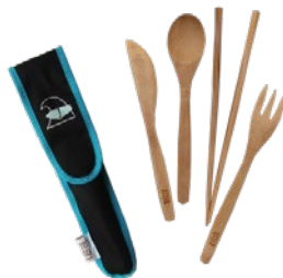
JJ Surfing Wave Bamboo Utensil Set